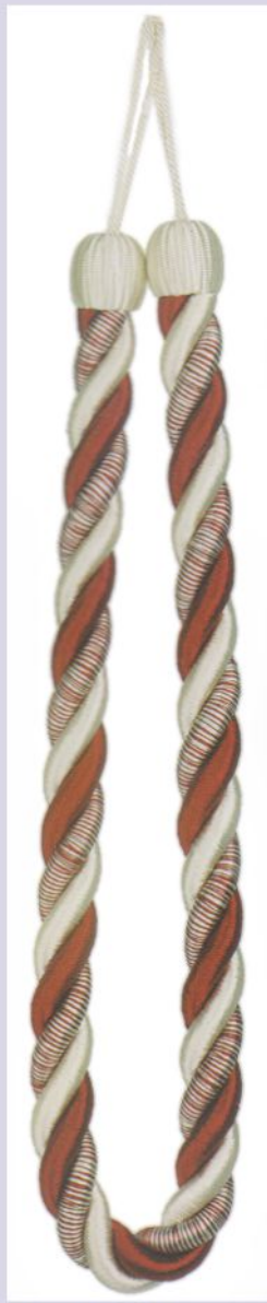
art. 1001 bracciale a cordone